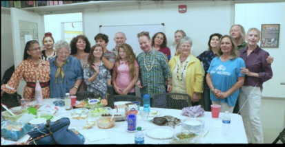
The Downwinders welcomed by Peter Sellars, director of the opera Dr Atomic .