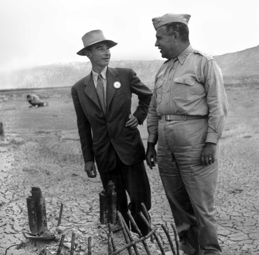
J. Robert Oppenheimer and General Leslie Groves, architects of the Manhattan Project.

Oppenheimer later came to regret designing the bomb. But Groves, while addressing congress stated, "Radiation is a pleasant way to die."