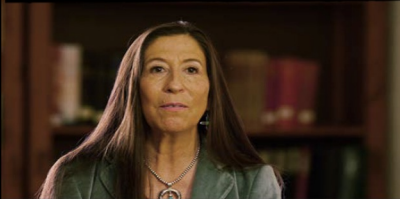
Congresswoman Teresa Leger Fernandez working to amend RECA, was also a lawyer for the Laguna Pueblo for 30 years.