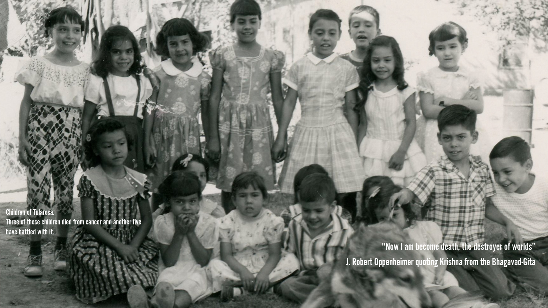
Children of Tularosa. Three of these children died from cancer and another five have battled with it.

"Now I am become death, the destroyer of worlds" J. Robert Oppenheimer quoting Krishna from the Bhagavad-Gita